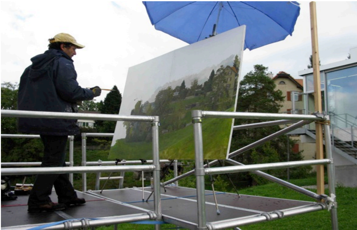
Panorama WBZ. Through the Looking-Glass Work in progress. Summer 2012