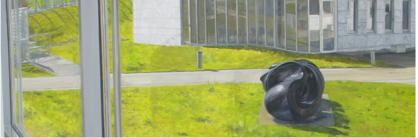
Panorama WBZ. Through the Looking-Glass Detail with other perspective on Tony Cragg's sculpture.

A video on this work at: http://db.tt/y1KZNIiO