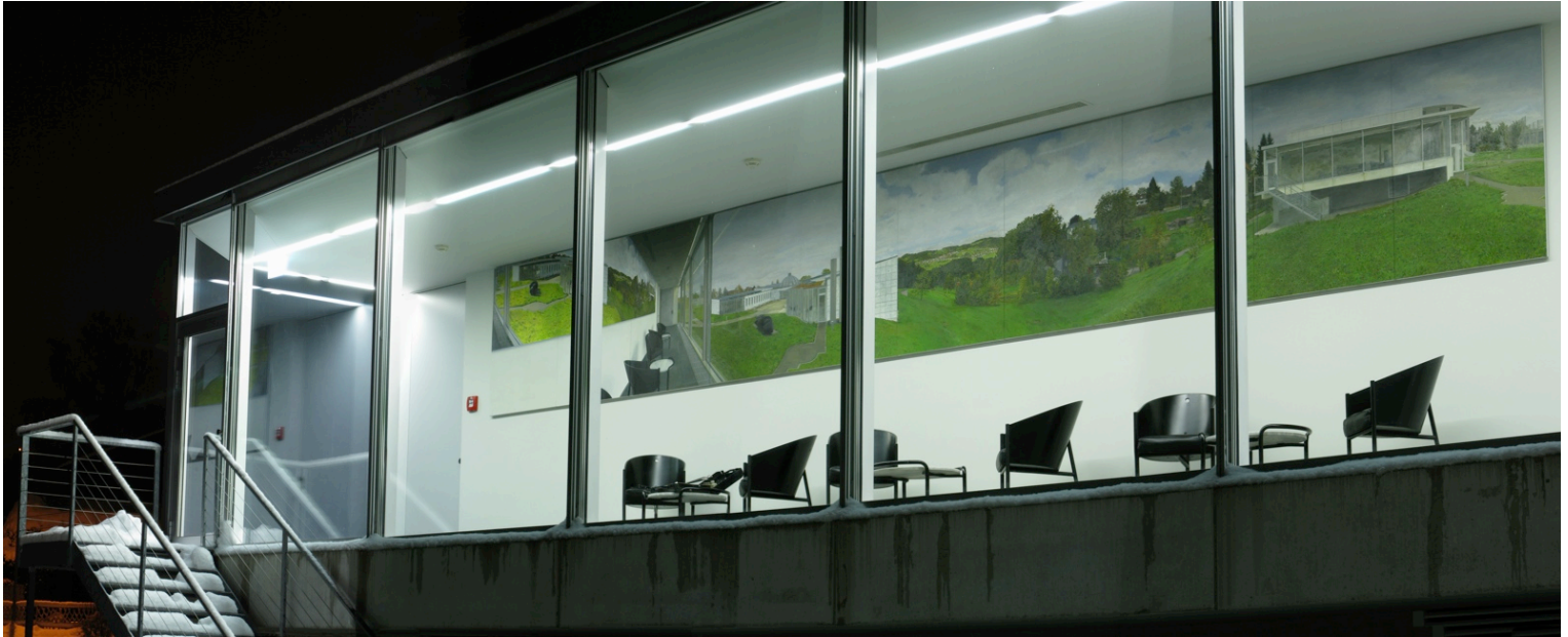
Panorama WBZ. Through the Looking-Glass

Panorama WBZ. Through the Looking-Glass is a polyptych oil on canvas, 9,60 meters long all together, in 10 pieces, commissioned by the University of St. Gallen in Switzerland.