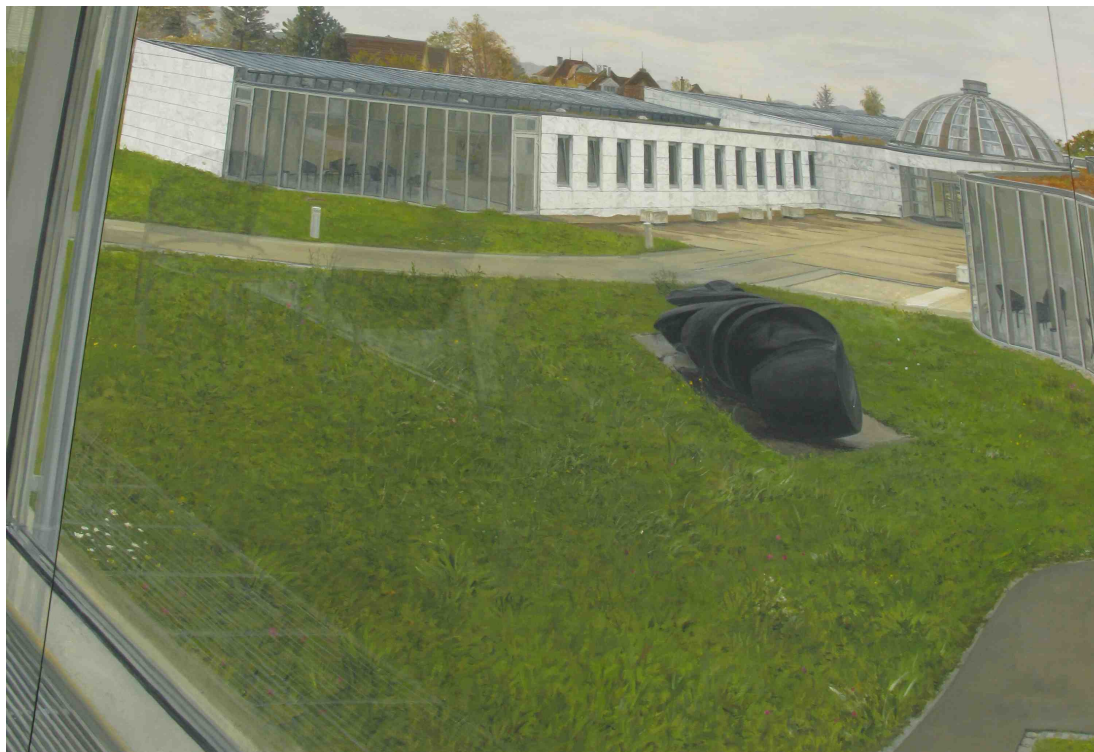
Panorama WBZ. Through the Looking-Glass