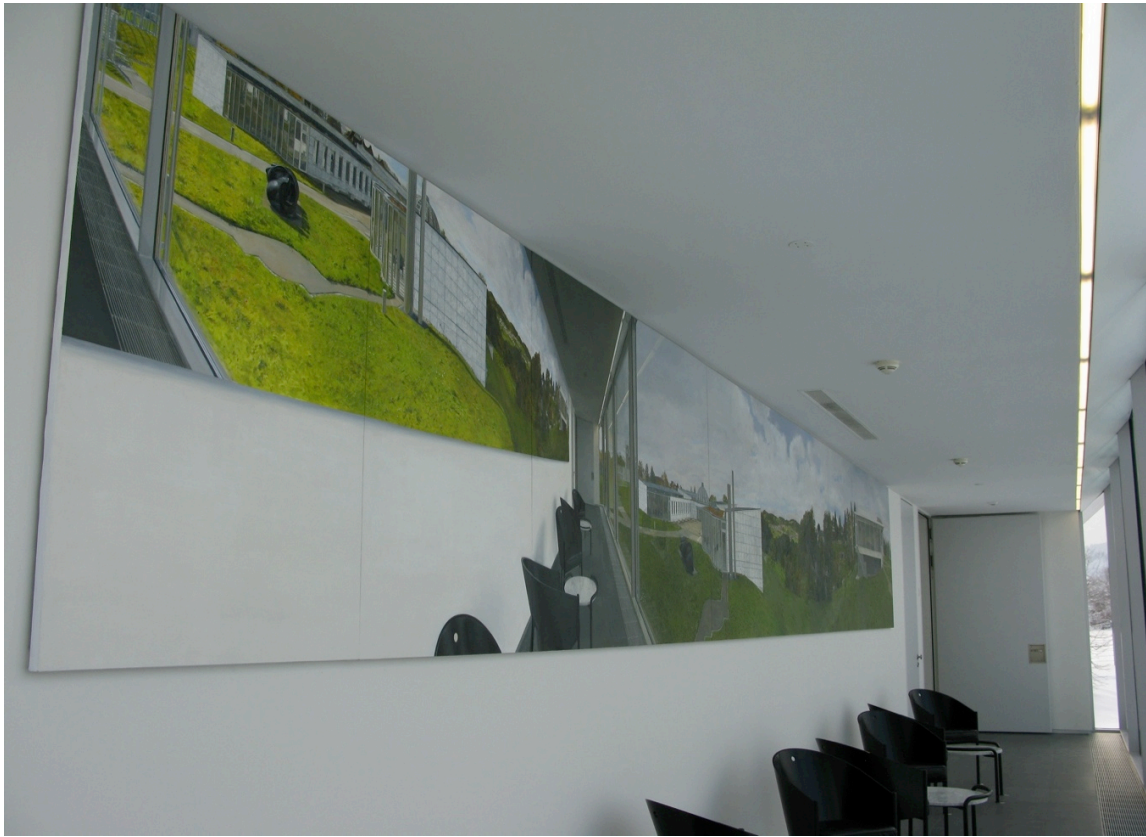
Panorama WBZ. Through the Looking-Glass Interior view.

Detail with one of the perspectives on Tony Cragg's sculpture.